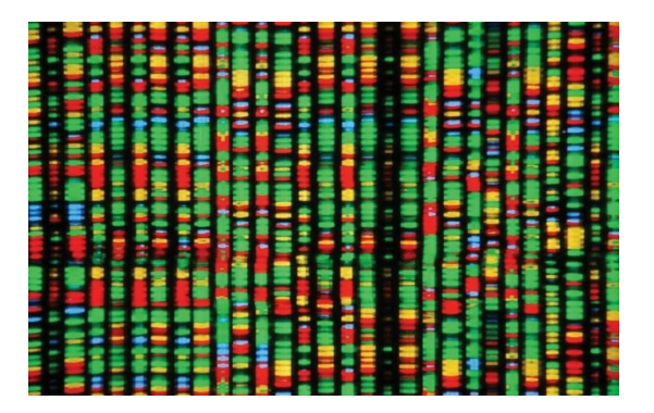
Figure 1 Human Genome

The bill's sponsors envision a state where mind concepts like gender identity can be distinctly spelled out somewhere along the almost 20,000 genes in the human genome. This concrete idea: we have a simple test for a complex issue – has been at the crux of many famous discrimination tragedies of humankind: the Arian nation in Nazi Germany, the "healthy Greeks" in ancient Athens and Sparta and, more recently, in numerous states' eugenics policies: Indiana 1907, etc.