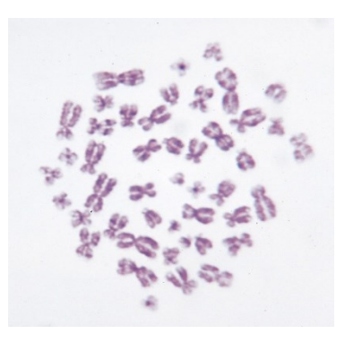
Figure 2 Human chromosomes

There is a federal law to prevent exactly this type of discrimination based on genetics : The Genetics Information Nondiscrimination Act of 2008 signed by President Bush<sup>1</sup>(GINA 2008)